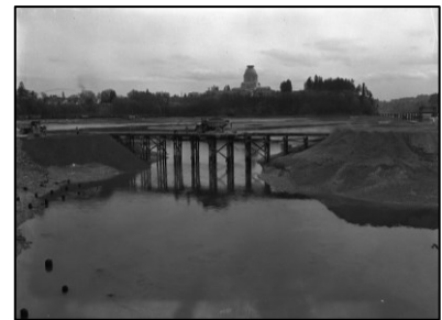
Exhibit 6.89 Deschutes Dam construction, May 5, 1950

Construction of the 5 th Avenue Dam in 1951 blocked the tidal exchange between the Deschutes River and Budd Inlet and created Capitol Lake. Capitol Lake is now a freshwater lake in Olympia and Tumwater, formed by this damming of the mouth of the Deschutes River. The 5 th Avenue Dam, which was intended to form a reflecting pool for the State Capitol Building, has altered the morphology and ecology of the lower river system.