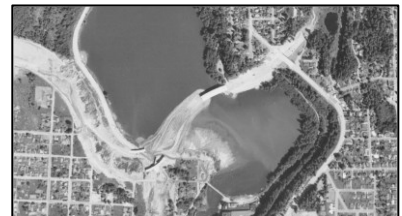
Exhibit 6.90 I-5 construction

Although different from their historic condition, Capitol Lake Basin, lower Deschutes River, and West Bay now include wetlands that provide habitat for a range of birds, fish, bats, aquatic and semiaquatic mammals, and dozens of invertebrate species. The Deschutes River basin includes commercial forestry in the upper basin and agriculture and rural residential in the middle of the watershed. Urban land uses in the lower watershed include portions of the Cities of Tumwater and Olympia.