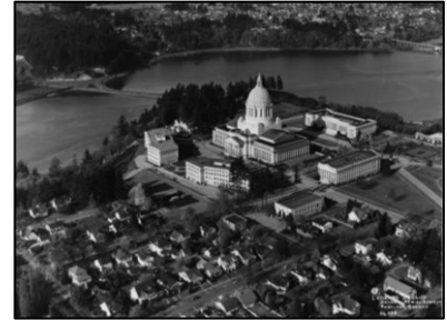
Exhibit 6.88 Aerial view of Capital Lake area, 1946

An early survey in the 1870s shows the Deschutes Estuary as a waterway, with the first constriction in the estuary mouth near the 4 th Avenue Bridge (Figure 6.4.1). Subsequent surveys performed during the next few decades, but prior to the installation of the 5 th Avenue Dam, show extensive tideflats as well as encroachment by railroad trestles. In 1929, the BNSF Railway Trestle was constructed across the mouth of the Deschutes River, separating what is now the North Basin and Middle Basin, and a railway was installed at the mouth of Percival Creek, creating Percival Cove. Around 1942, the 5 th Avenue Bridge was constructed using earthen fill.